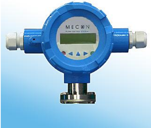
Fig 1 Magnetic inductive transmitter mag-flux M1